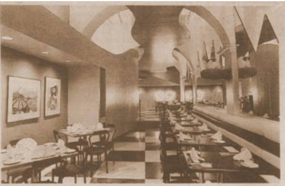
The original Pikayo at Old San Juan, circa 1990.