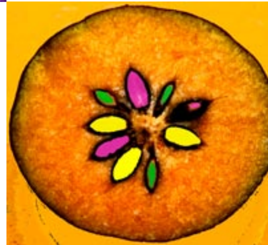
Gastronomic Impressionism Top left: Lapin Vert Above: Níspero Bottom Left: Petit Breakfast

In ten years, his company will have opened 5 more restaurant locations between Puerto Rico and the US, designed his own line of products to be sold in convenience stores, designed a line of products for the table based on Gastronomic Impressionism , and have written several publications about Puerto Rico's food as well as his experiences in the culinary arena.